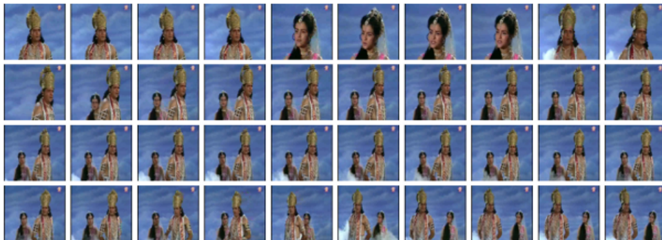
Figure 1: A learnt temporal segment which is pure as it consists of frames from a single scenes. Note that it also covers several shots, and the two persons appear alternately

Here, we give examples of three temporal segments from Maha65 learnt by SpMI, to illustrate our evaluation measures for segmentation. Each segment is visually represented by the set of the first frames of all tracklets covered by it.